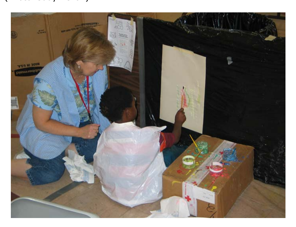
Figure 1. A volunteer sits with a young boy as he paints a picture at a CDS child care center established in Florida after Hurricane Ivan

In the event of a disaster and when a need for child care has been identified, CDS volunteer caregivers from across the country are mobilized and the team becomes responsible for child care service provision at the disaster site. In local disasters, CDS volunteers work with local government and community-based organizations as needed. In the event of a Presidentially-declared disaster, CDS volunteers are mobilized at the request of the American Red Cross or FEMA and provide child care services based upon a memorandum of understanding between the organizations. CDS does not respond to every disaster in which the American Red Cross and FEMA are involved, but rather works collaboratively to assess the need for child care services in each major disaster. Although it is a challenge to mobilize resources and volunteers in the immediate aftermath of disaster, CDS has always been able to respond to events when called upon by the American Red Cross or FEMA.