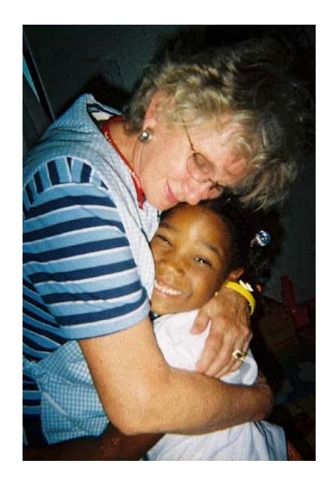
Figure 4. A CDS caregiver hugs a child who was evacuated to Colorado in the aftermath of Hurricane Katrina